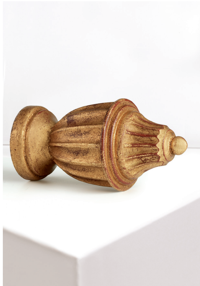
SLEEK URN Ornate Shown. Available in: 1 3/8", 2".