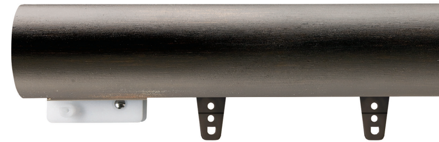
ESTATE™ ROD WITHOUT RINGS

Rustic Tortoise Shown Custom Sizes Only Additional rings sold separately