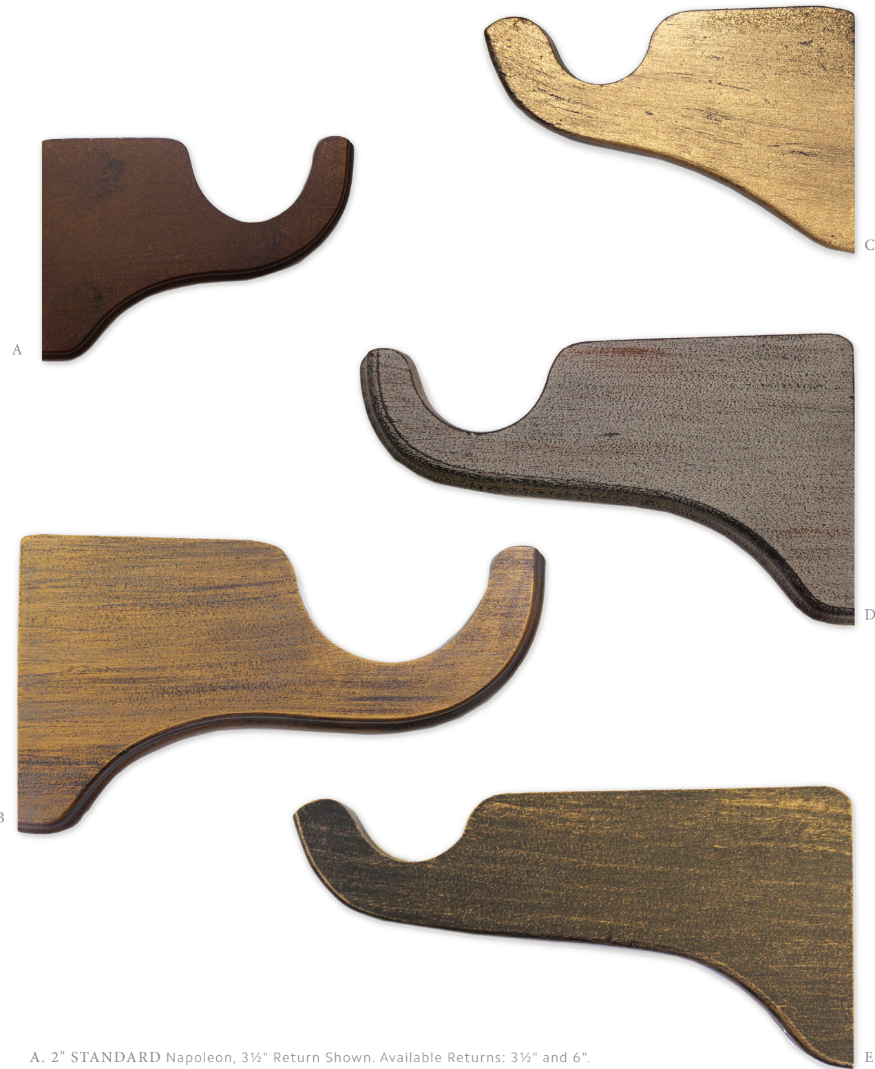
A. 2" STANDARD Napoleon, 3½" Return Shown. Available Returns: 3½" and 6".