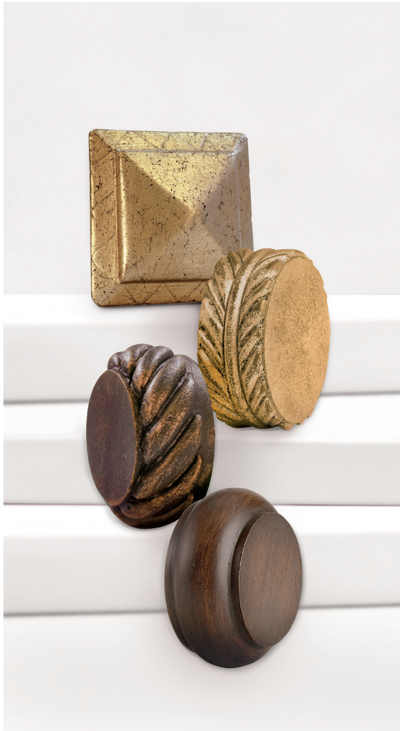
CROSS GEOMETRIC Shimmer Shown. Available in 1 3/8", 2", 3".