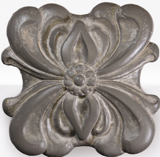
CROSS GEOMETRIC Slate Shown