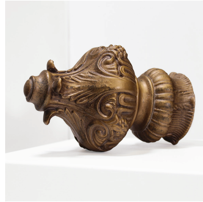
REGAL Ornate Shown. Available in: 1 3/8", 2", 3".