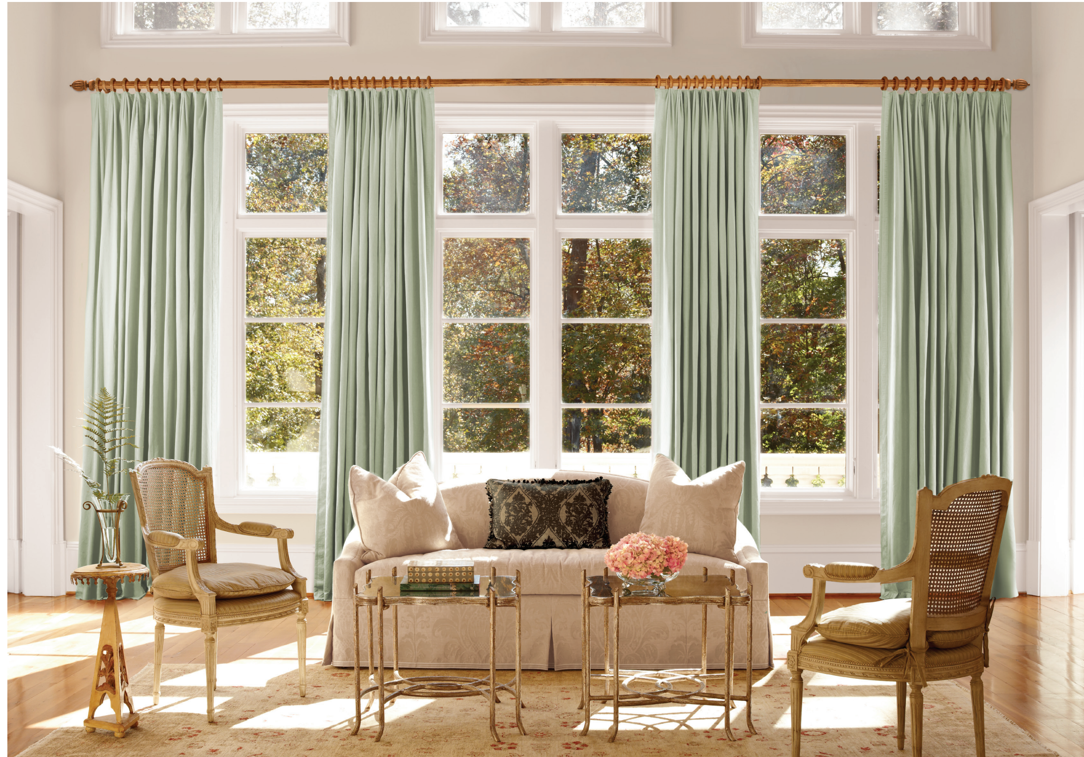
BERKSHIRE Ornate Shown