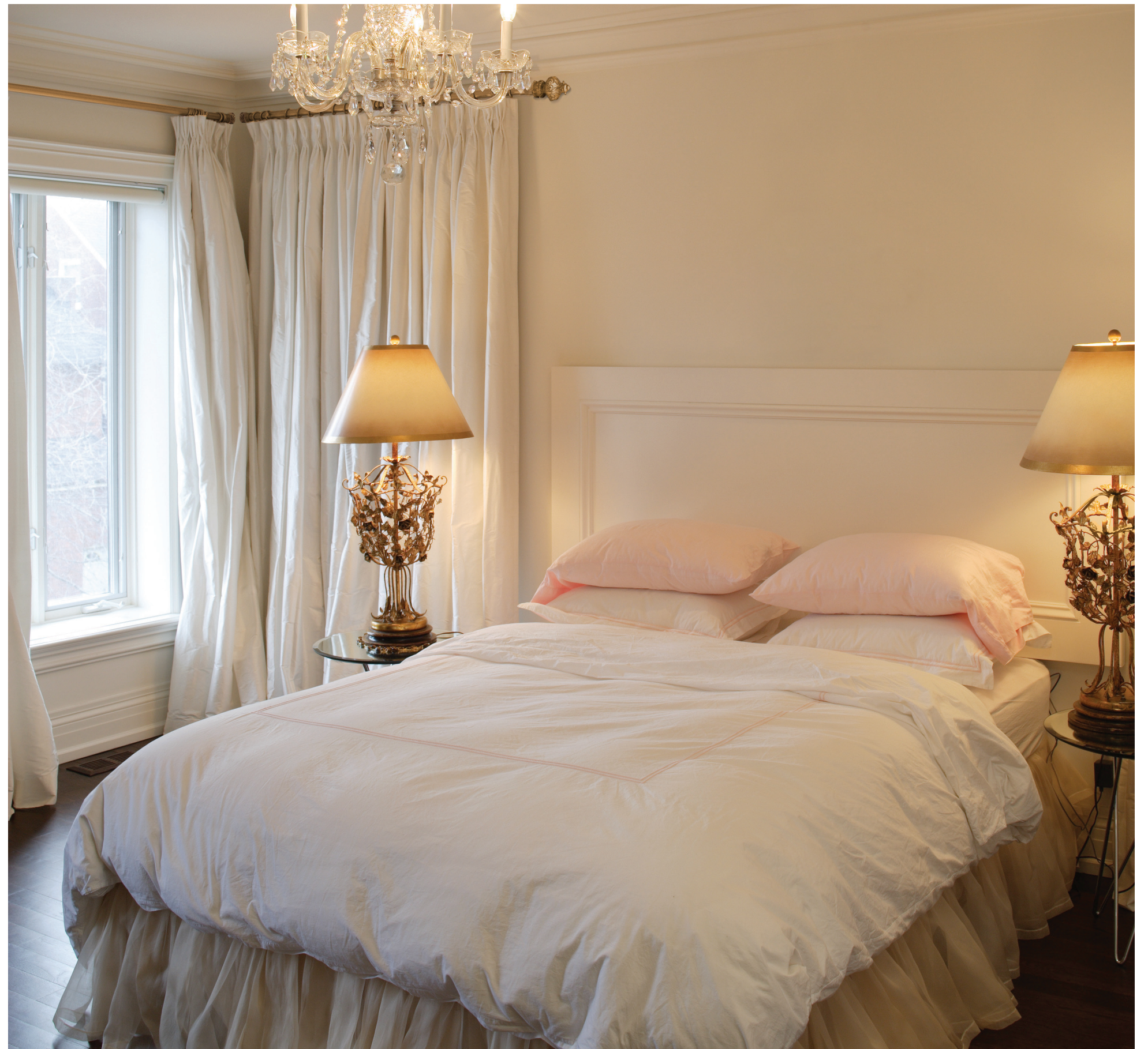
REGAL Ornate Shown