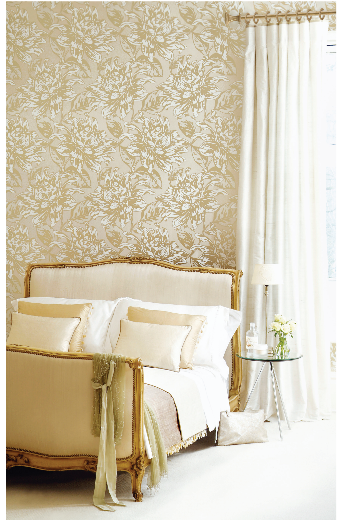
CROSS GEOMETRIC Shimmer Shown