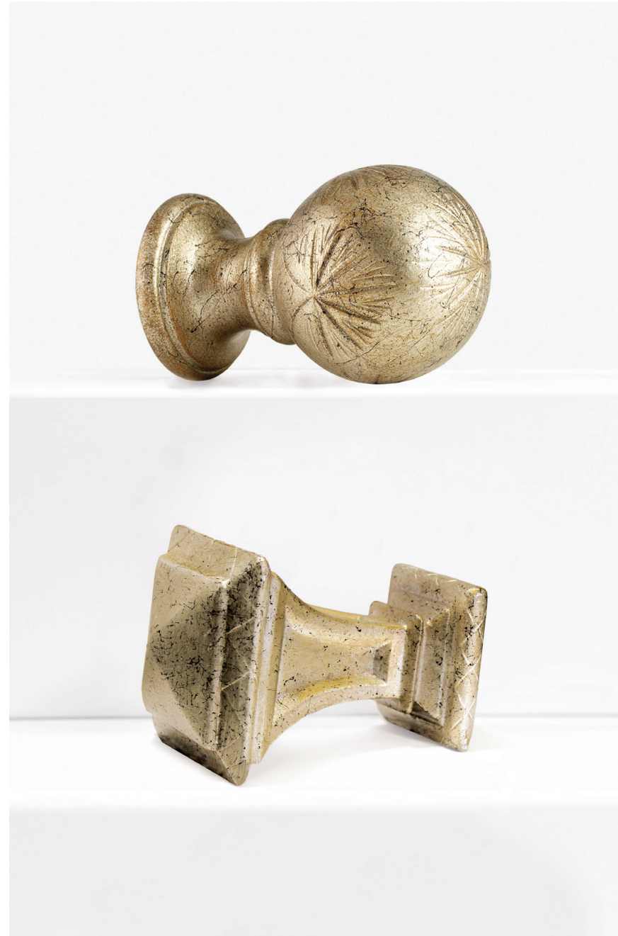
STARLIGHT Shimmer Shown. Available in: 1 3/8", 2". CROSS GEOMETRIC Shimmer Shown. Available in: 1 3/8", 2", 3".