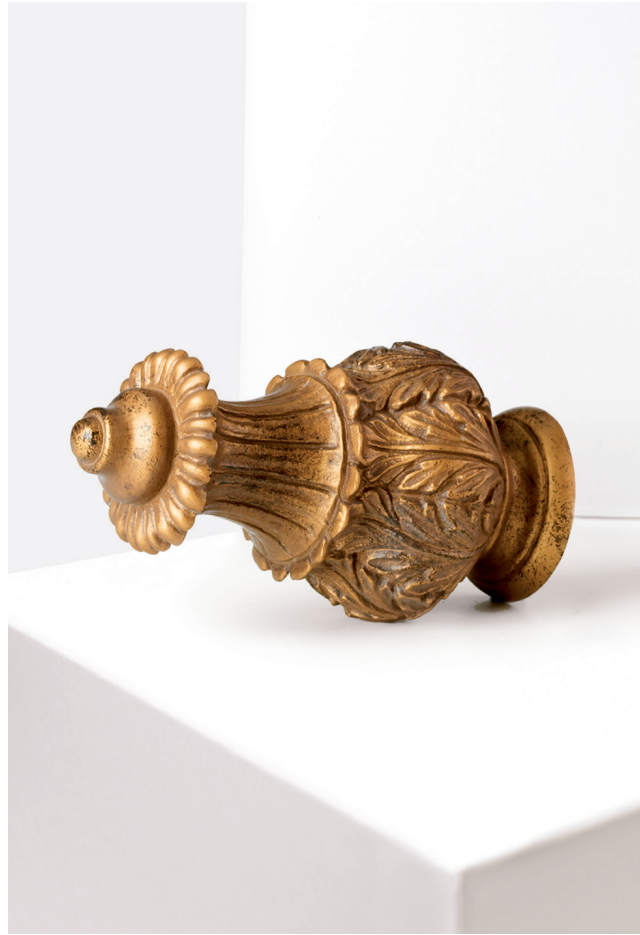
EMPRESS Ornate Shown. Available in: 1 3/8", 2".