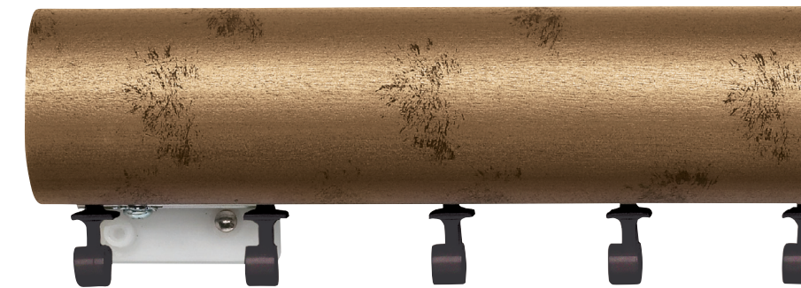
ESTATE™ ROD WITH RIPPLEFOLD™