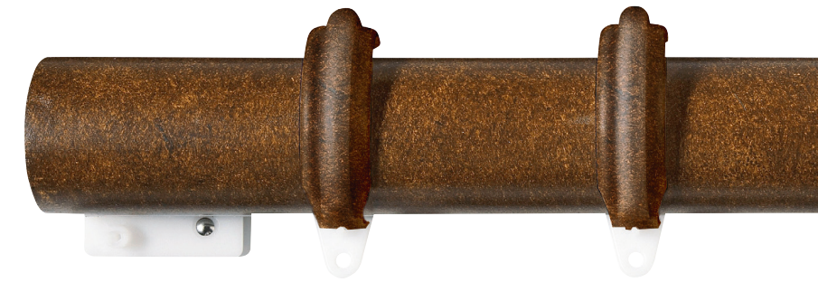
ESTATE™ ROD WITH RINGS

For details on what is included with your Estate™ traverse rods please refer to the Kirsch® price list.