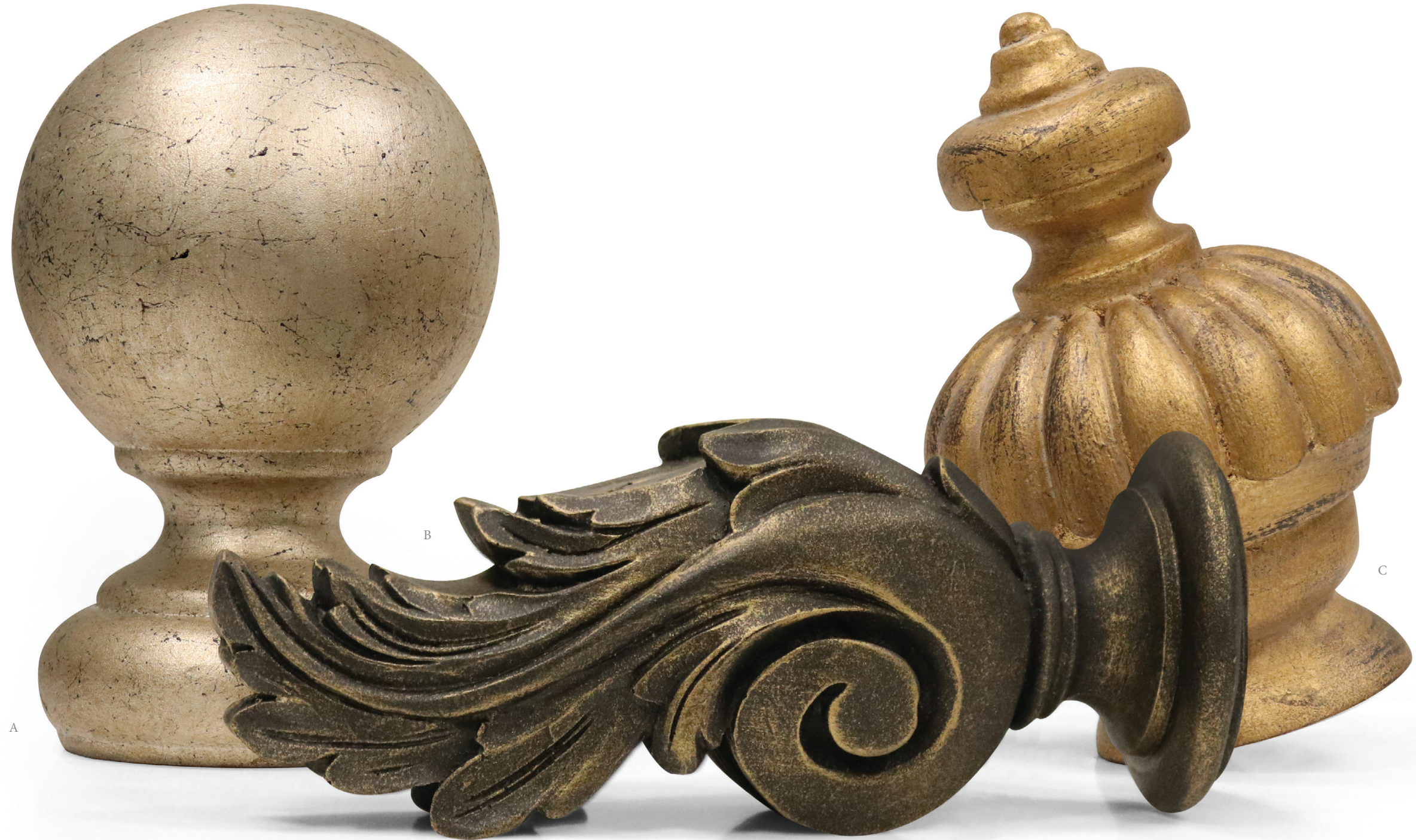
A. WOOD BALL Shimmer Shown. Available in: 1 3/8", 2", 3".