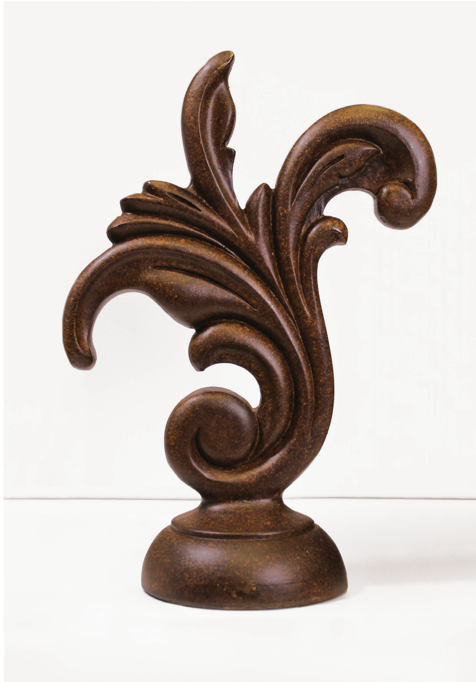
LEAF DANCE Rustic Tortoise Shown. Available in: 1 3/8", 2", 3".