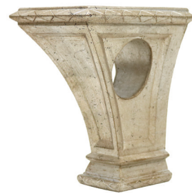
LEAF CORINTHIAN Aged Gold Shown