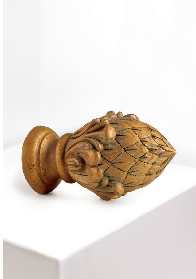
PINEACANTHUS Ornate Shown. Available in: 1 3/8", 2".