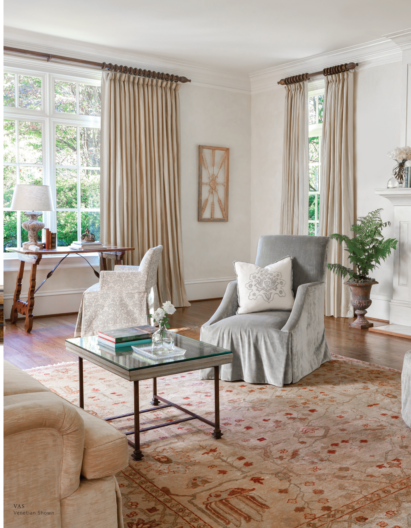
VAS Venetian Shown