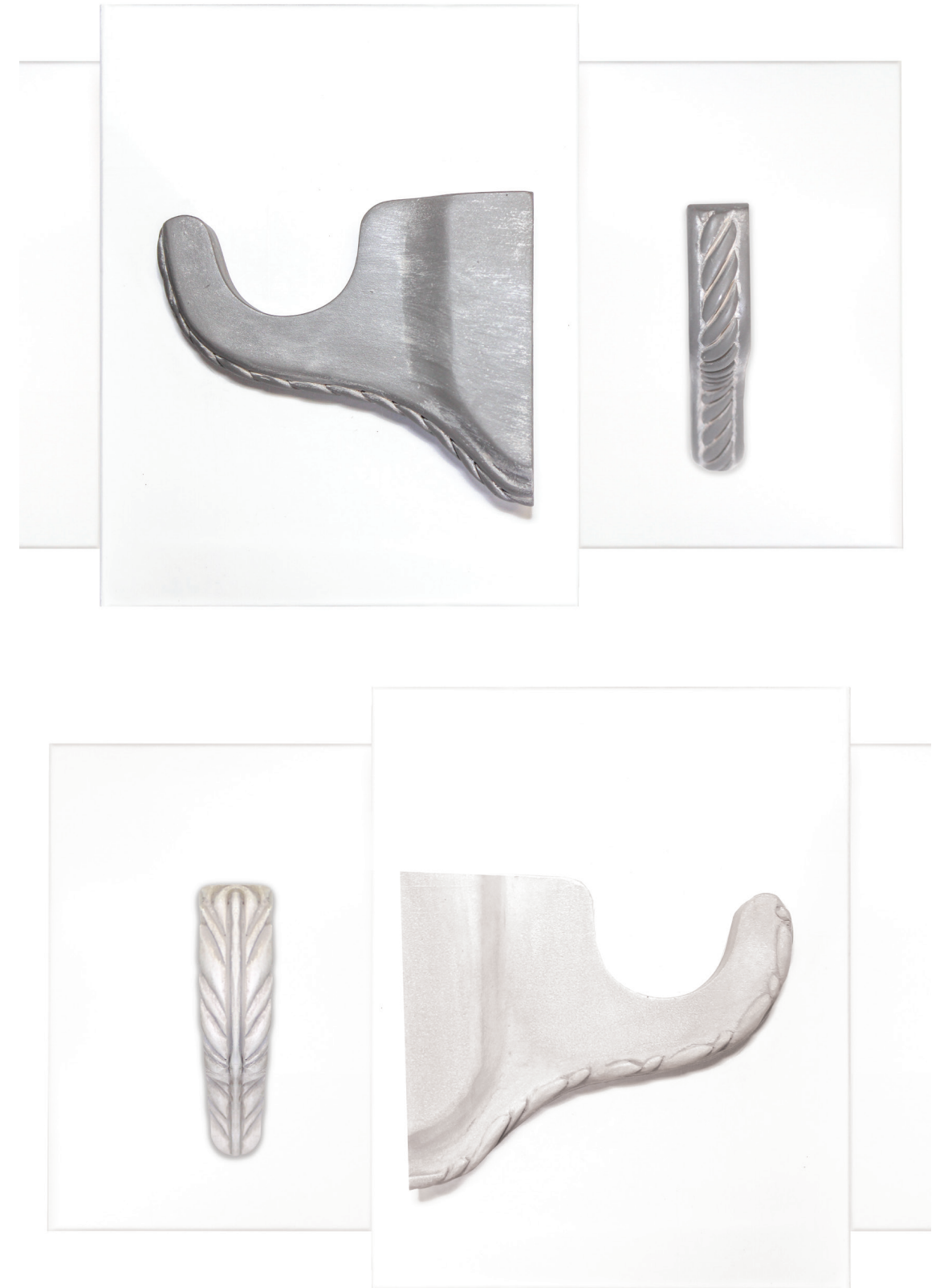
2" ROPE Ash Shown. Available Returns: 3¾".