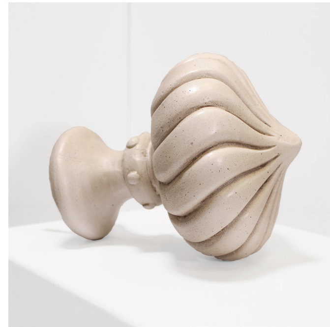
ONION DOME Old World White Shown. Available in: 1 3/8", 2", 3".